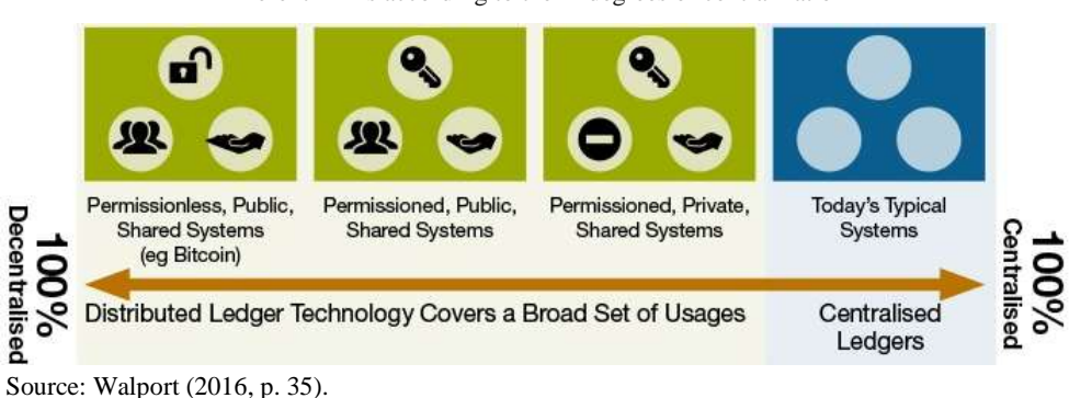
Figure 2 Different DLTs according to their "degrees of centralization"

Cryptocurrencies: technology, initiatives of banks and central banks, and regulatory challenges